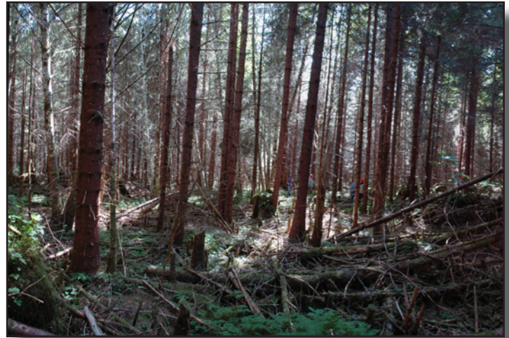
Young growth forest in the Ocean Boulevard unit pool