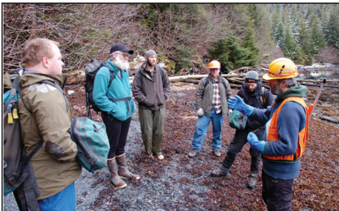
Collaborative group during a site visit in March 2009

March 2009: SCS and the Sitka Ranger District conduct a 2-day site visit with community stakeholders of a portion of the IRMP project area. We discuss potential restoration needs, techniques, and uses of restoration by-products.